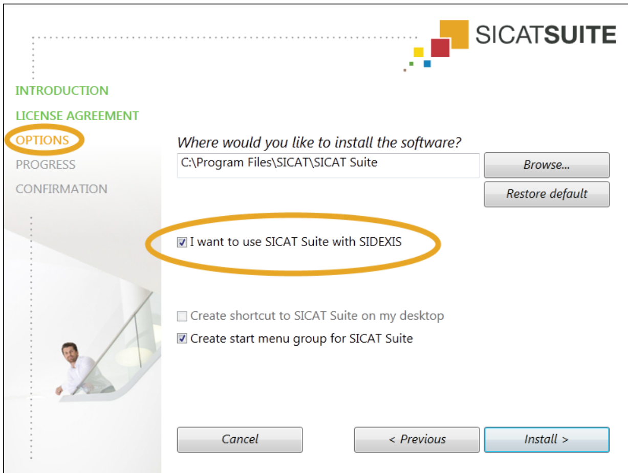
SICAT Suite installer: Select the option for use with SIDEXIS

During the installation, activate the option "I want to use SICAT Suite with SIDEXIS" in Options in the SICAT Suite installer :